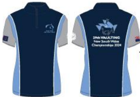
Training Top $60

Limited production for Training Tops and Jackets (25 of each only) "First in - Best dressed"