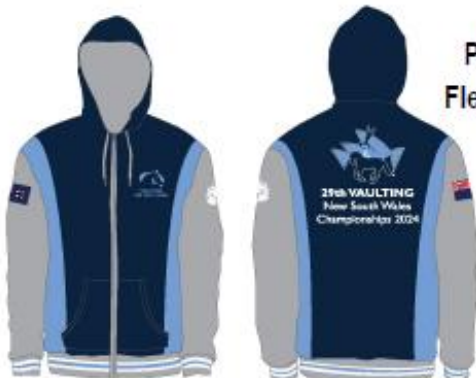
Poly/Cotton Fleecy Hooded Jacket $90

Limited production for Training Tops and Jackets (25 of each only) "First in - Best dressed"