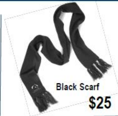
Black Scarf $25