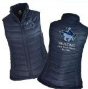
Puffer Vests $85