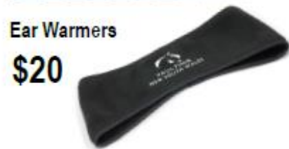
Ear Warmers $20