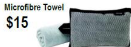
Microfibre Towel $15