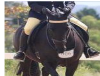
Darcy Park Show Standardbreds